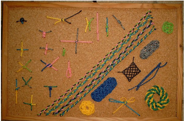
If you take a cork notice board sold with frame and pin your knots with sewing pins or tacks, you can use it for instructions. Here they used brass dolls-house nails.

Below is an example of a way to make a knot board. When teaching Pathfinders how to tie knots it's helpful to have a knot board or 2 around. A lot of the Pathfinders keep asking "is this right?" when they haven't got anything close to right! With the knot board you can simply ask them if they think it looks like what's on the knot board.